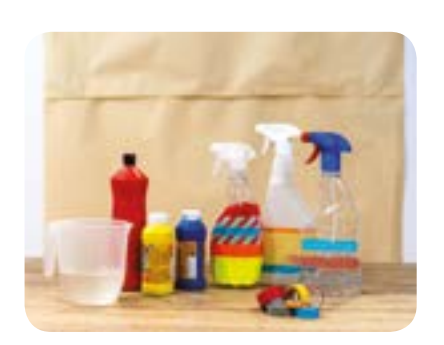
Fill the spray bottles with different colours of watered down paint.