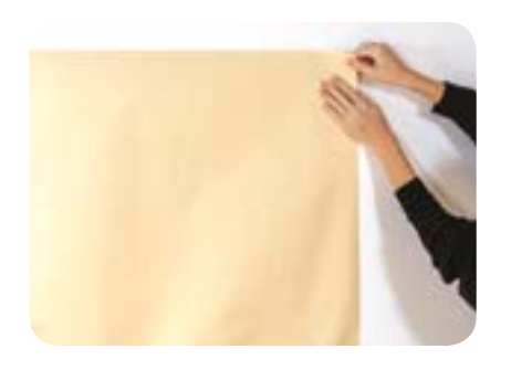
Tape the paper to a vertical surface such as an easel or a wall or fence in the garden.